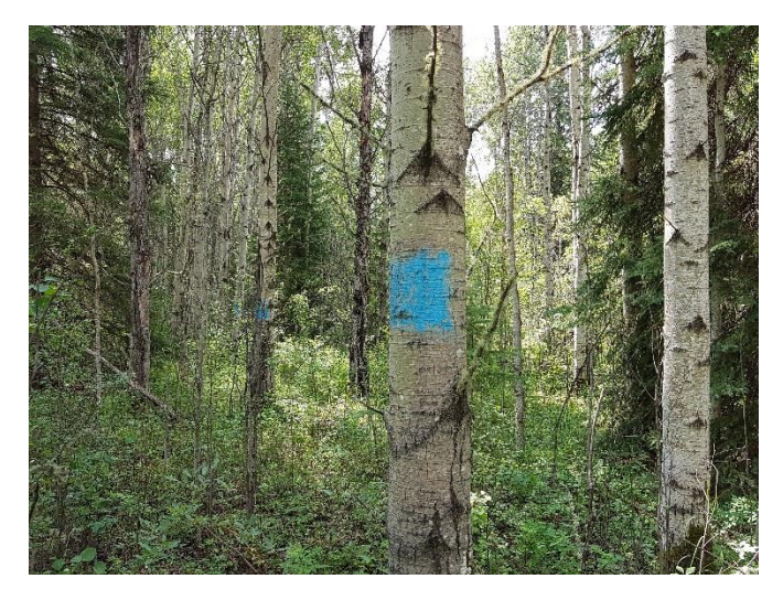
Figure 2. Typical natural PSP with blue paint marking outer boundary

Al-Pac has been operating on the landbase since 1993 when the company initiated a sampling program which relied on Temporary Sample Plots (TSPs). In 1994, a PSP program was initiated for natural stands across the FMA area. As can been seen in Figure 1, the program's PSPs are distributed across the FMA area. Due to the fact that only 27% of the landbase is considered part of the harvestable landbase sampling of plots are located through a stratified random sample process instead of a grid-based layout. This was done to achieve a proportional sample of targeted stand types to inform future harvest plans and timber supply modelling. In the years since the beginning of the Al-Pac's Growth and yield program, significant landbase changes have occurred and are being incorporated into future plans for data collection and analysis of forest resources. (See Figure 2 for an illustration of a natural stand PSP)