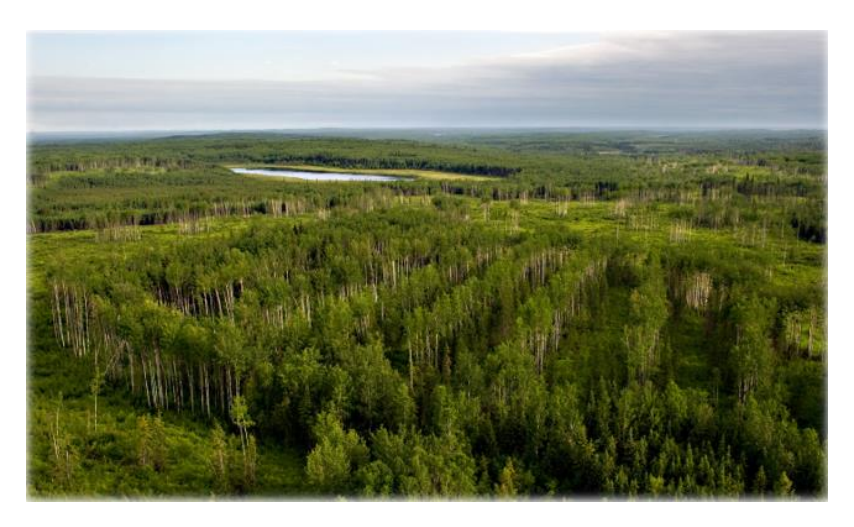
Figure 3. Al-Pac Understory Protection Harvest Block in FMU L1