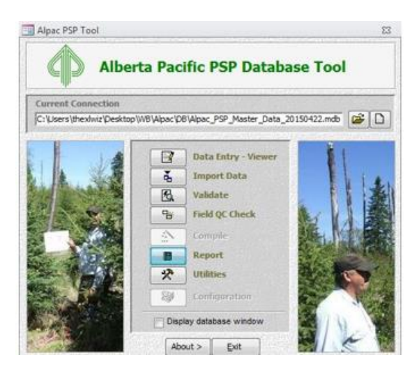
Figure 8. Al-Pac PSP database application – main interface

To effectively manage forest resources, Al-Pac must monitor and understand forest stand dynamics over time. As part of this program, Al-Pac has implemented various PSP, SCUP and TSP programs to better understand the landbase and the forests. In conjunction with PYGI, Al-Pac is changing and modernizing its growth and yield program to be more cost effective and representative.